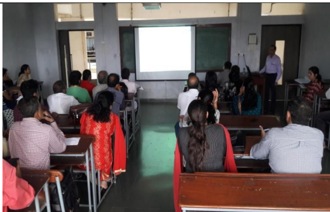
Parent Proctor Meeting