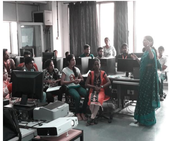
Workshop on Virtual lab