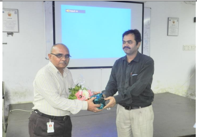
Guest Lecture on Industrial Automation