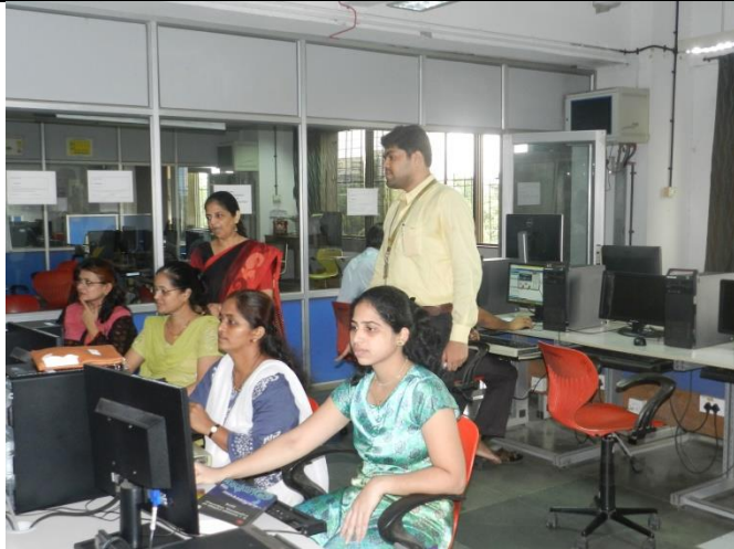
Virtual Lab Training