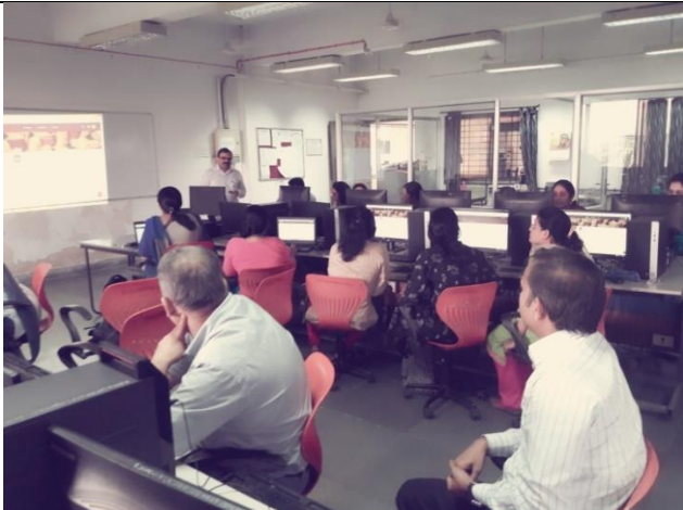
Google Classroom Workshop