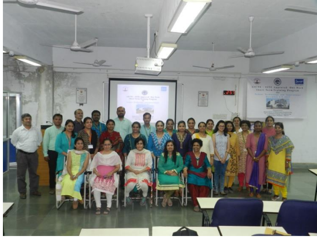
STTP on Sensors