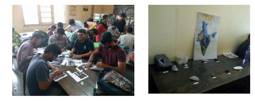
The geology department organised a geological fest called Terra Firma on 20th December 2017.