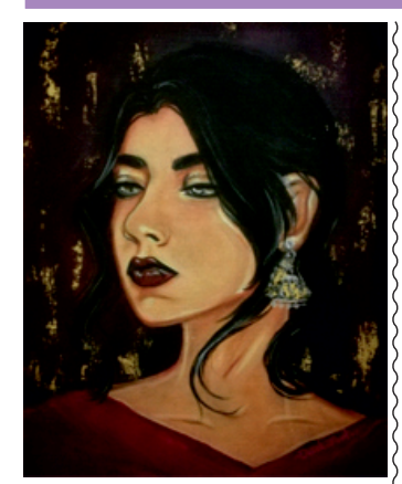
Who are you? What's your name? What defines you? Are you just here for the fame?

The sunlit sky and the scholar mind will always have respect for the arsty kind.