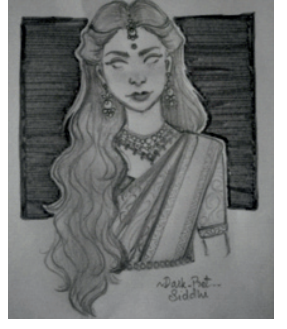
I look back To what's made me, me. What do I lack? Who should I believe? Is it the culture? Is it the hate? Is it the memories? Or is it the fate?

Long journey ahead But don't you worry This light will take you home Home that will help in recovery.