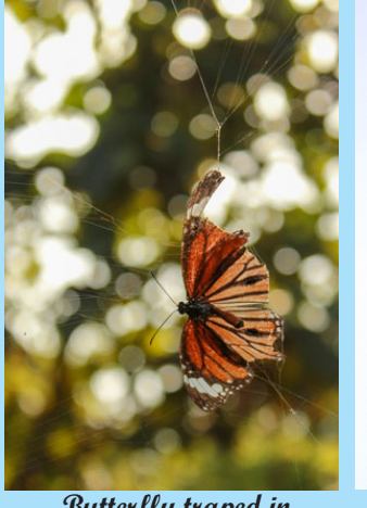
Butterfly traped in spider web