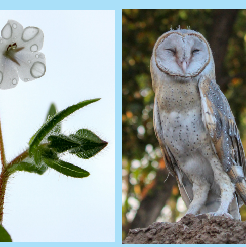
High-key of Trichodesma